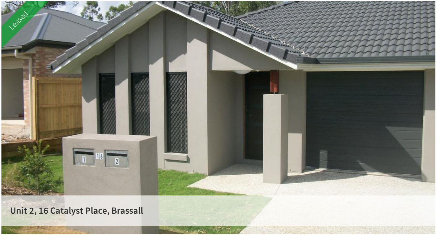
Unit 2, 16 Catalyst Place, Brassall