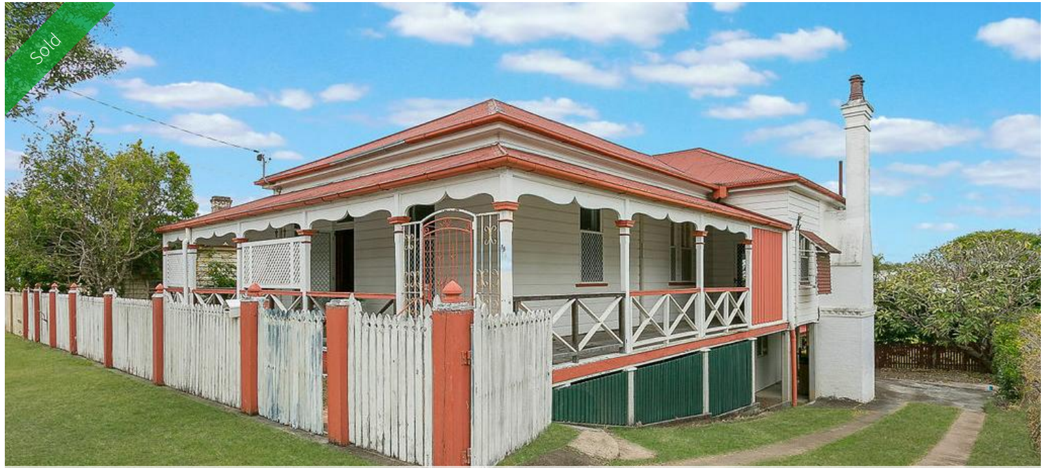
16 Arthur St, Woodend