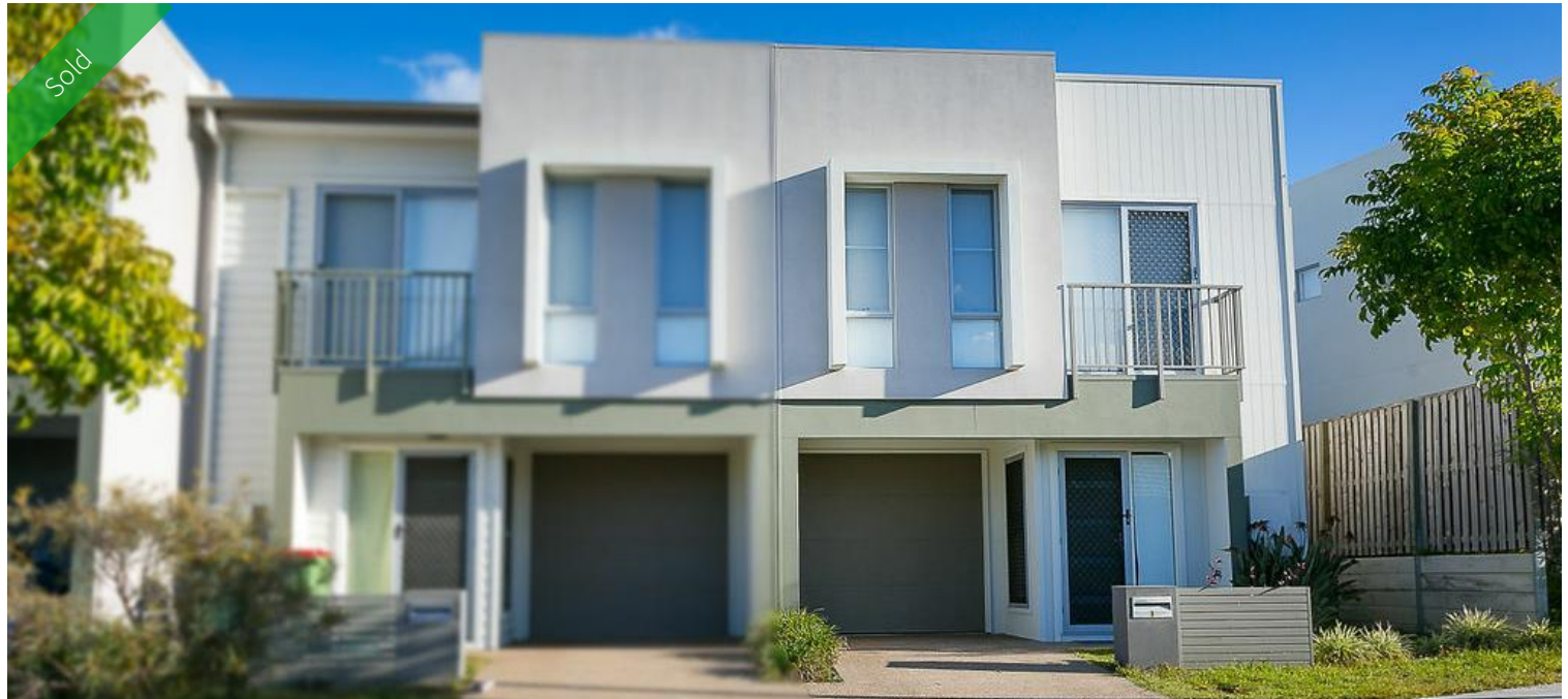
8 Koda St, Ripley