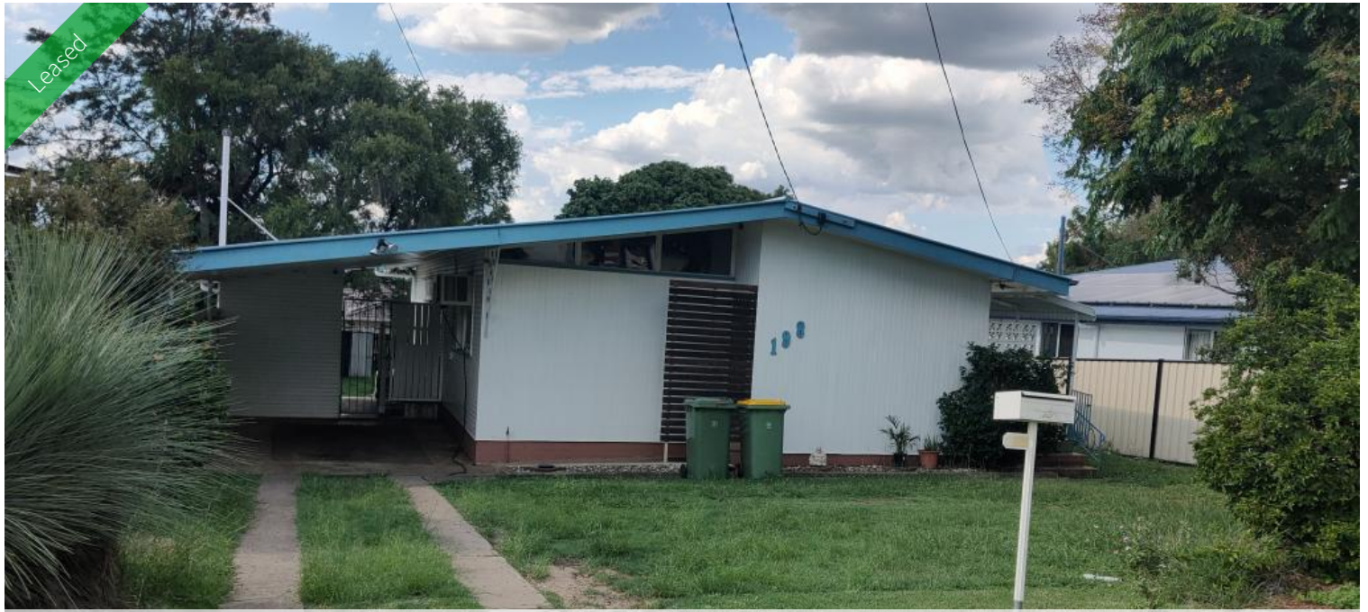
198 Cascade St, Raceview