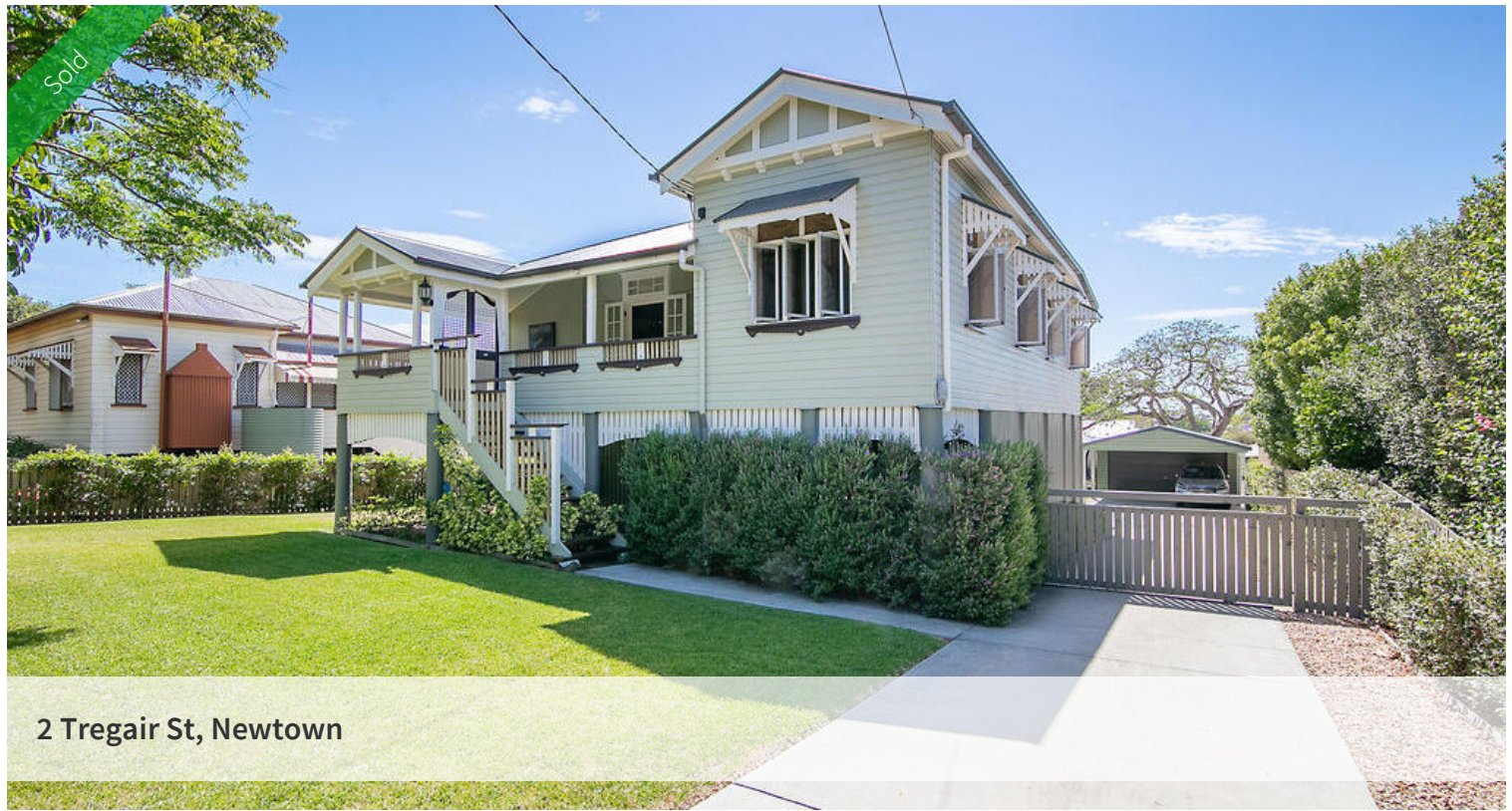
2 Tregair St, Newtown